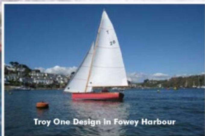
Troy One Design in Fowey Harbour

The traditional Yawl Black Tie dinner was at the new Salcombe Harbour Hotel. They did a great job, the room was nicely laid out and we had cocktails on the deck outside beforehand and we even had some evening sun.