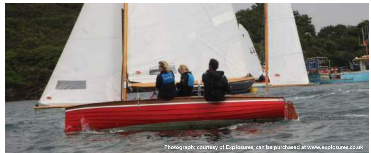
Photograph: courtesy of Explosures, can be purchased at www.explosures.co.uk

01548 842005 info@explosures.co.uk www.explosures.co.uk